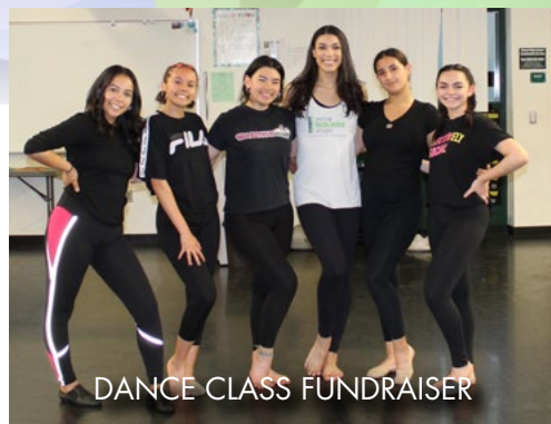
DANCE CLASS FUNDRAISER