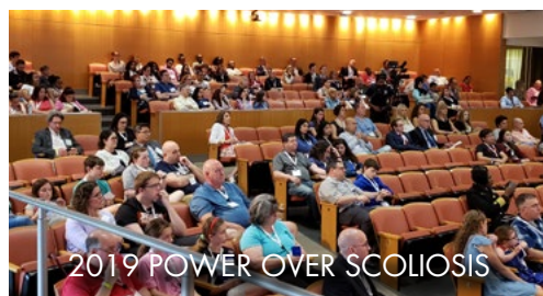
2019 POWER OVER SCOLIOSIS