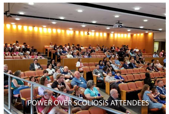
POWER OVER SCOLIOSIS ATTENDEES