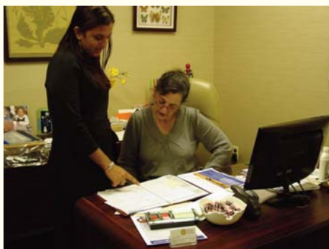
The staff at Scoliosis and Spine Associates are always hard at work scheduling patients and collecting important study data